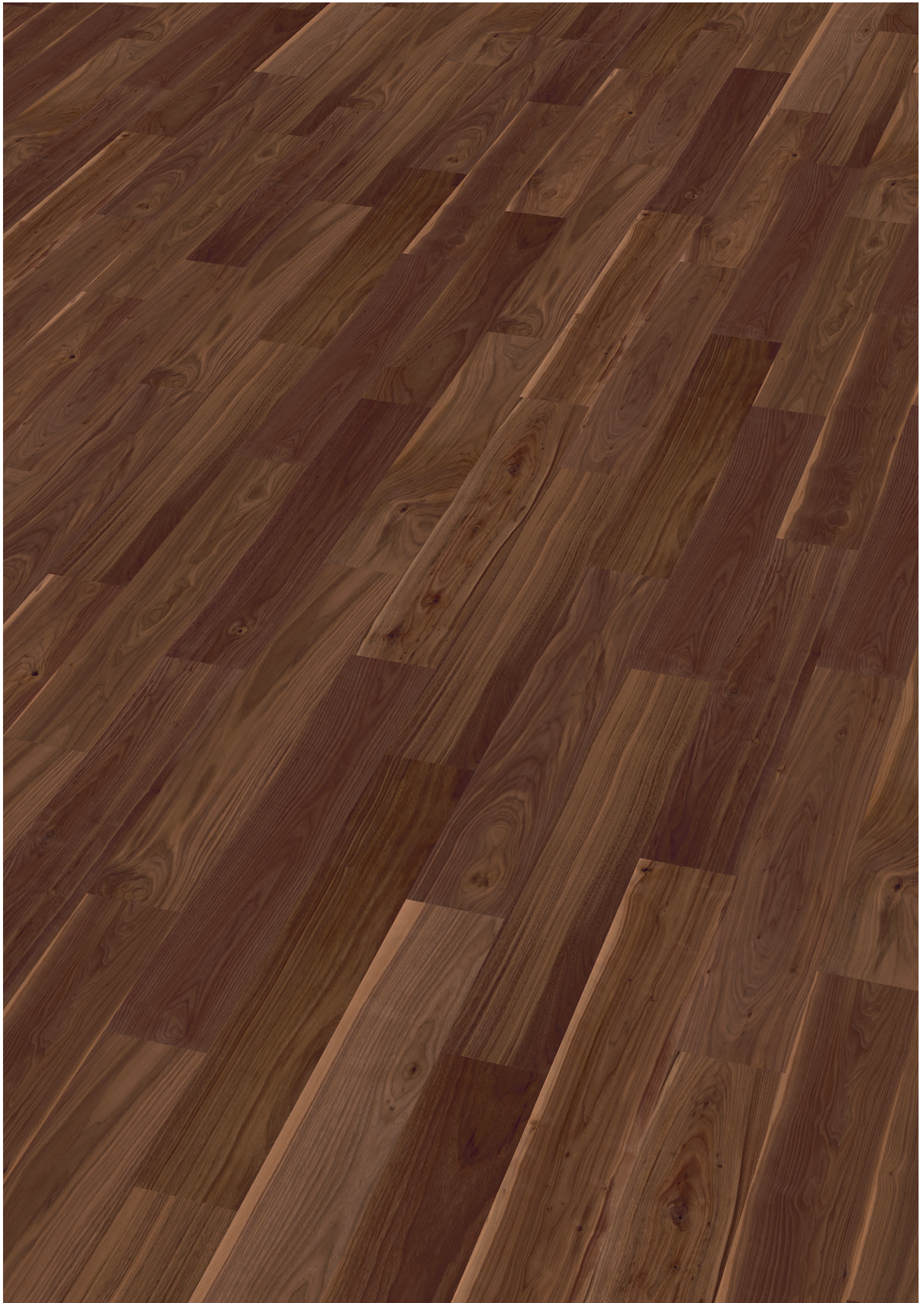
Symbol picture - may vary in colour and structure