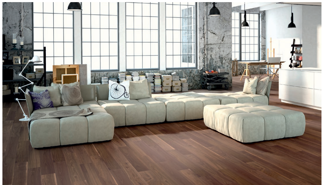
Symbol picture - may vary in colour and structure