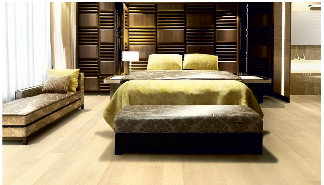
Symbol picture - may vary in colour and structure