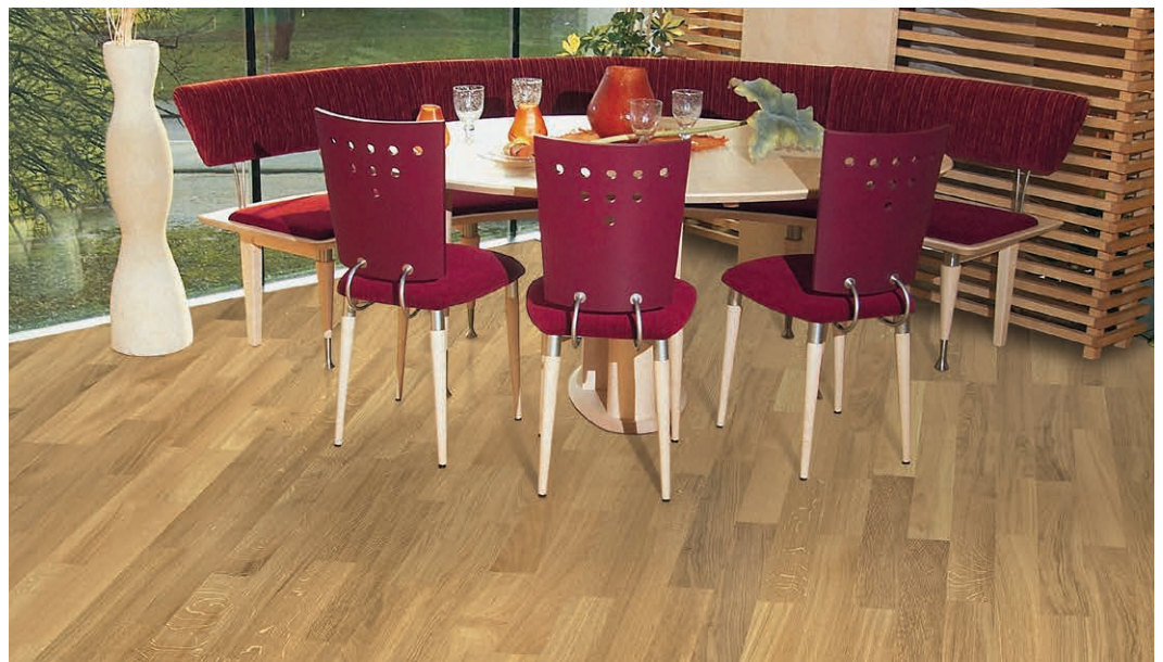
Symbol picture - may vary in colour and structure