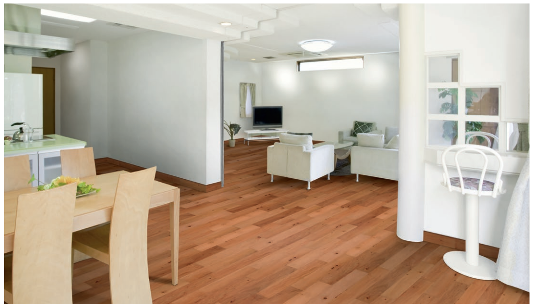
Symbol picture - may vary in colour and structure