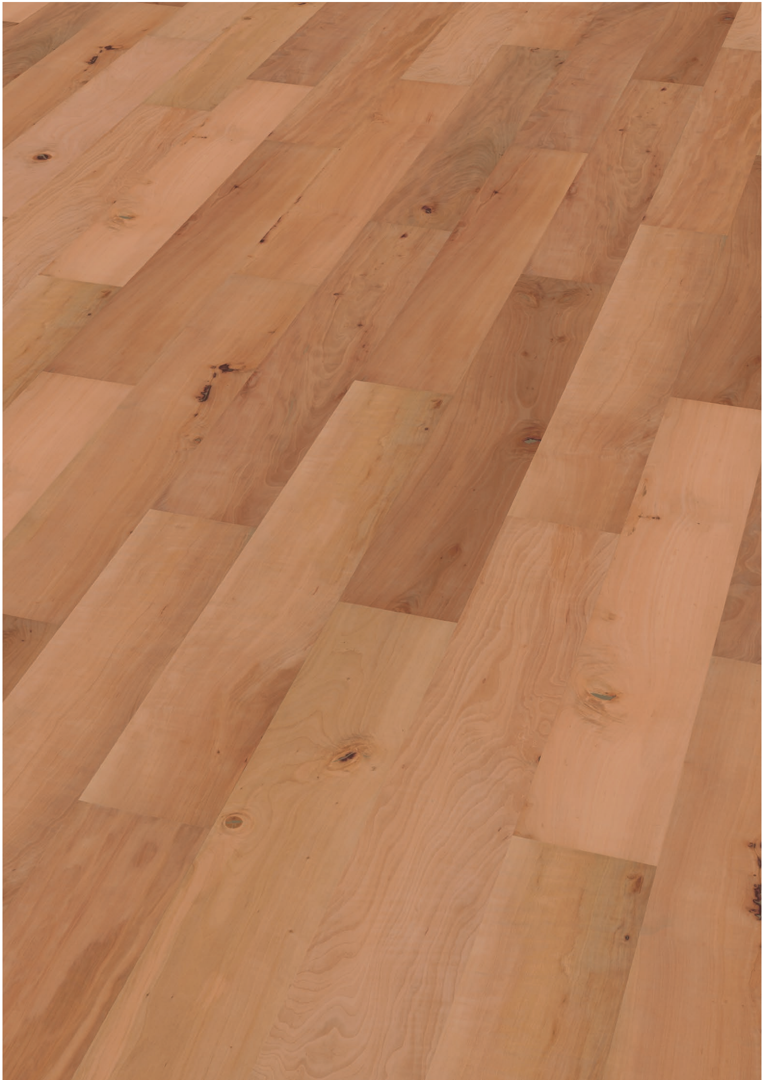
Symbol picture - may vary in colour and structure