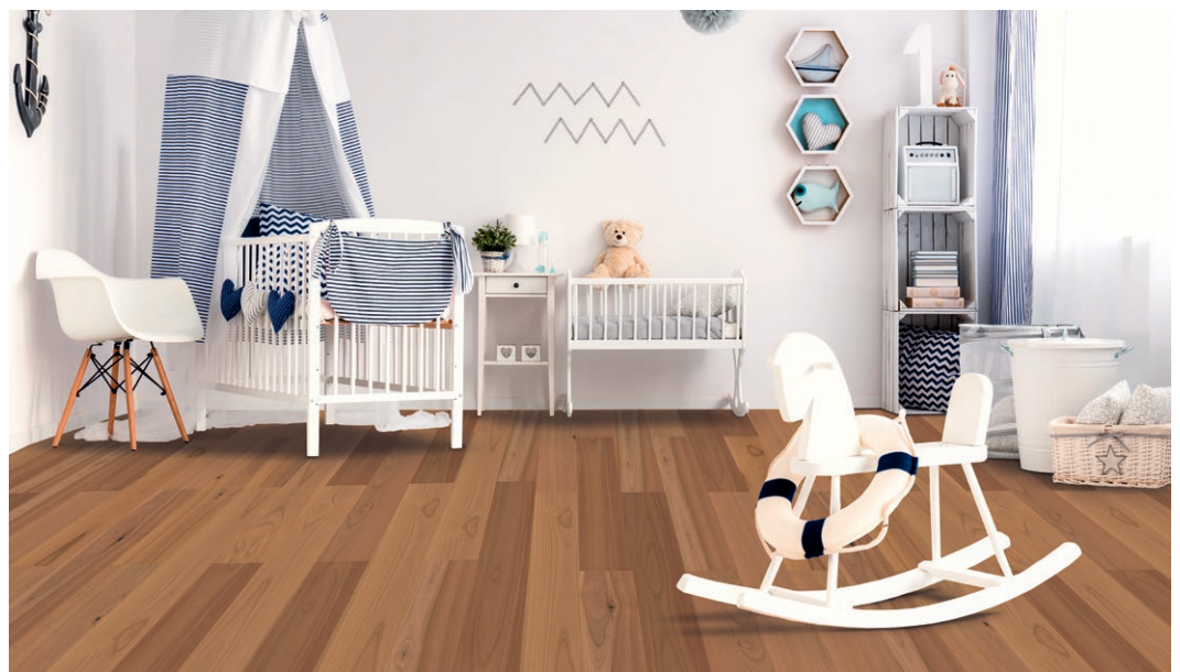
Symbol picture - may vary in colour and structure