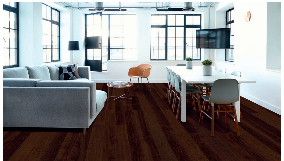
Symbol picture - may vary in colour and structure